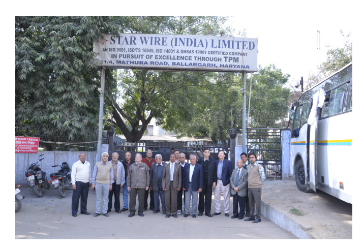
The visit to Star Wire Industries, Ballabhgarh, ended with thanks to their senior officials for facilitating this visit.